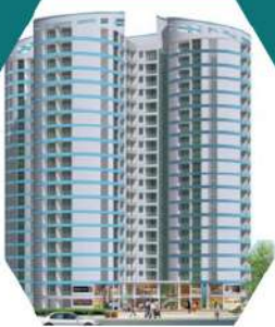
APEX ACACIA VALLEY VAISHALI GZB