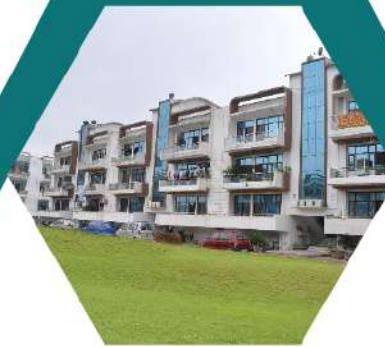
APEX ROYAL CASTLE NYAY KHAND-2 INDRAPURAM