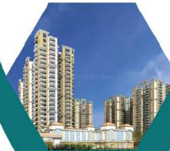
APEX ATHENA SEC 75 NOIDA