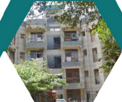
APEX MEDIA TIMES ABHAY KHAND IV- INDIRAPURAM