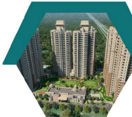
APEX GOLF AVENUE SEC 1 GR NOIDA(W)