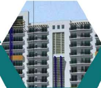
APEX THE FLORUS VASUNDHARA GZB